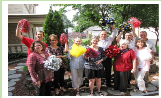
Above: We're Cheering for You!