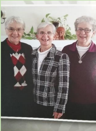
Sisters of Charity